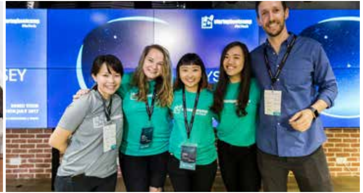
Startup Bootcamp Fintech Singapore team