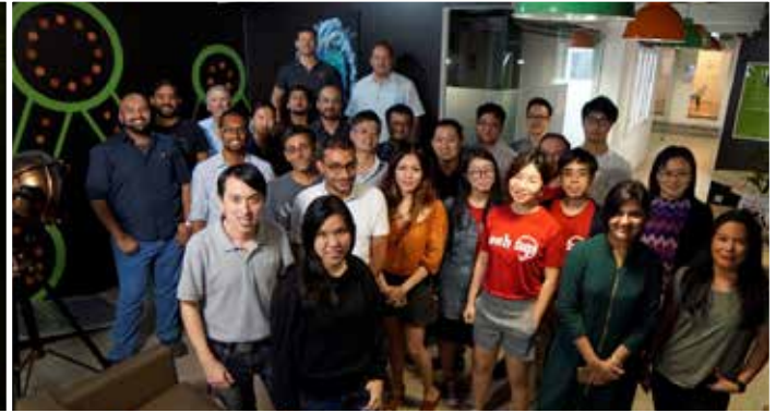
muru-D Singapore cohort three