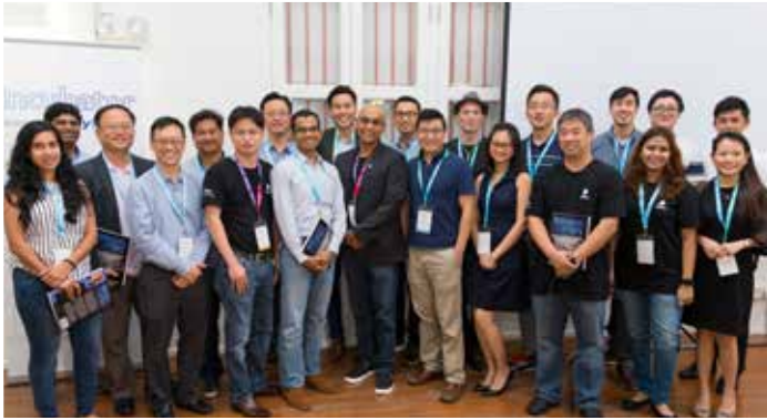
PayPal Incubator team with startups