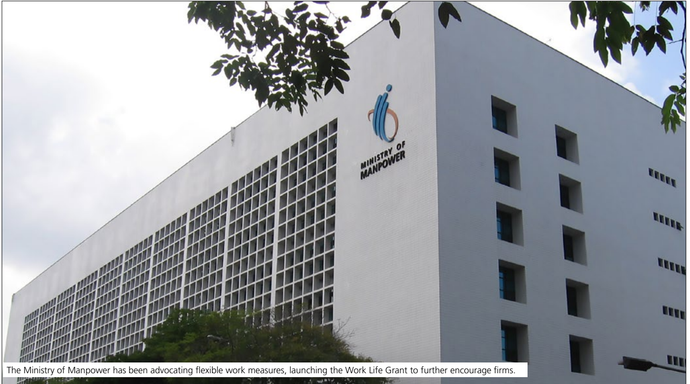
The Ministry of Manpower has been advocating flexible work measures, launching the Work Life Grant to further encourage firms.